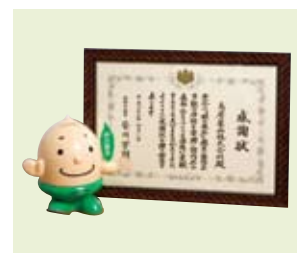
Green Fund certificate from the Director-General of the Forestry Agency.

In addition, another leave system was introduced in support of bone marrow donation. Under this system, the prospective donor is allowed paid leave for the number of days necessary for the testing and procedures, including hospitalization for donor registration and actual donation.